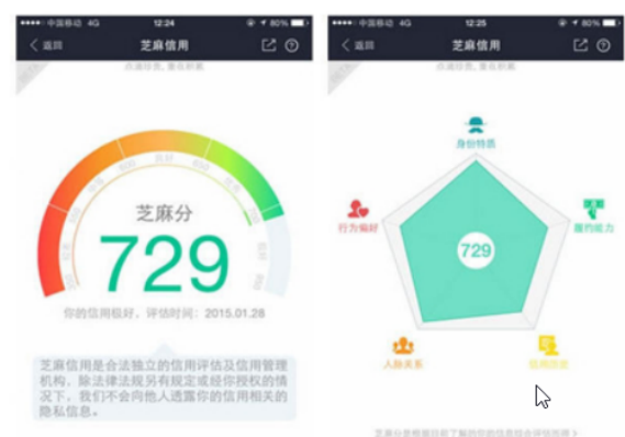
Fig. 3 Graphical User Interface of the Sesame Credit displaying indicators used to evaluate citizens. SOURCE: [24].

Launched in January 2015, the Sesame Credit aims at reaching 1.4 billion Chinese users until 2020, when is set to become mandatory to all people in China [1]. In addition to financial history and consumer habits, Sesame Credit also considers “legal regulations, moral as well as professional and ethical” [22]. Sesame Credit’s scoring system is based on five indicators, as Fig. 3 shows below: