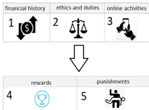
Fig. 4 Sesame Credit rewards and punishment mechanics of personal data conversation.

Fig. 4 summarizes the operation of the Sesame Credit in terms of the nature of the user data which are analyzed to generate the score of the five indicators shown in Table 1; and also, the consequences of the scoring regarding government rewards and punishments: