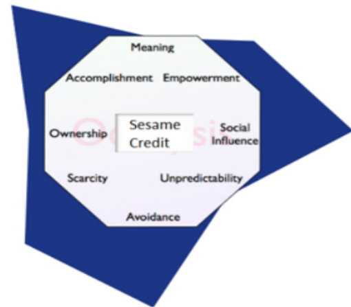
Fig. 6 Sesame Credit analysis through the Octalysis methodology.

As follows, the application of the Octalysis methodology as Sesame Credit’s interpretative and analytical instrument. Fig. 6 summarizes such analysis: