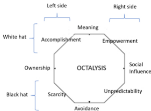
Fig. 1 The Octalysis model.

Developed by Chou [10], the Octalysis consists of a methodology of generation and development of gamification strategies. The author, who was, for years a game designer in California, works currently as a gamification adviser, draws a set of eight essential motivations. In other words, ways to engage a user presented visually as an octagon: